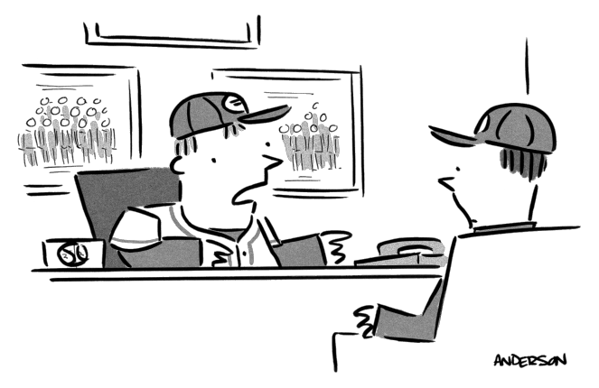
"You've been traded for some big data, two spreadsheets, and an algorithm."

Traditional rubrics fail to reveal the best answers, or how to explain those answers to others. After explaining why, the following system solves both failures.