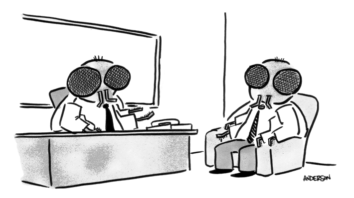
"So, where do you see yourself in ten minutes?"

We've explored how to estimate "impact" with Fermi-approved values, but what about time-estimates? Those also exhibit large errors. They, too, need the Fermi treatment.