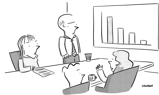
"I remind you that I recommended against upping our game while simultaneously taking it to the next level."

These ties are not a failing of the system. Just the opposite: It means we are able to identify ties, rather than allowing noise to trick us into believing one is the "winner."