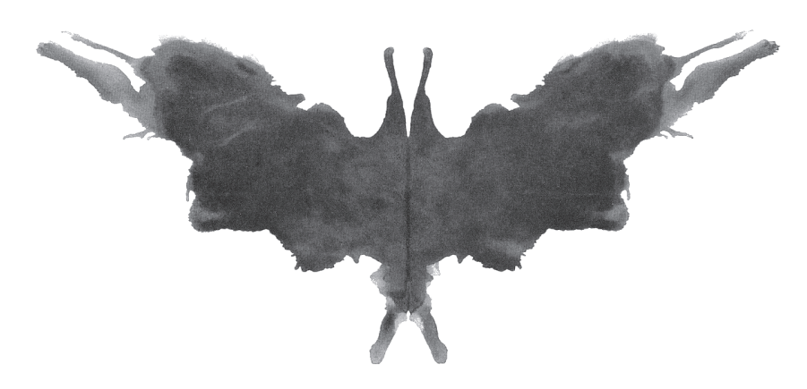
The Butterfly Effect (Actually Rorschach, 1948)

Students were asked to recount memories while moving marbles between two trays. When moving marbles from a lower tray to a higher one, the memories were more positive; when moving downward the memories were more negative. (source <sup>12</sup>)