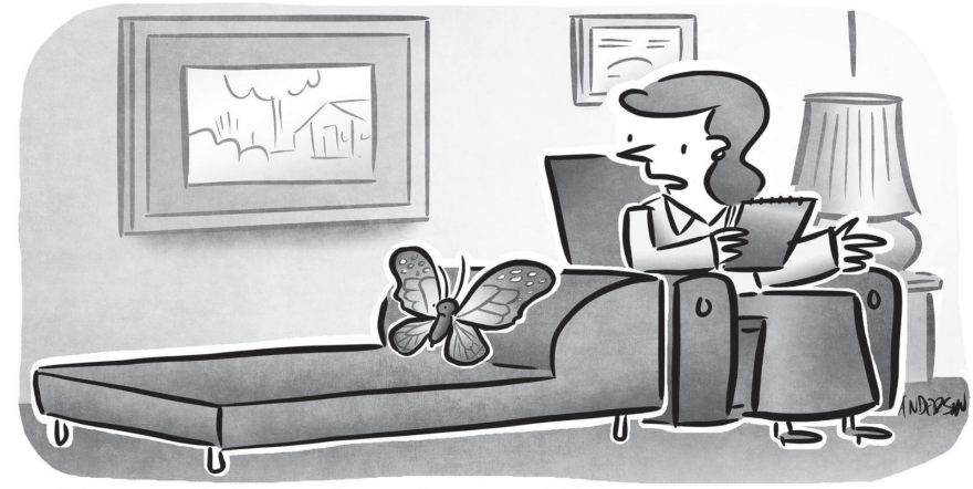
"So you believe that when you flap your wings on one side of the planet, all kinds of crazy things are caused on the other side? That sounds like a lot of responsibility."

It's a great story: Little actions can have enormous influence. A small favor you do on Twitter results in a viral post seven months later. A small change to your download page results in 20% more trials. A subtle shift in background color increases average time-on-site by 27 seconds.